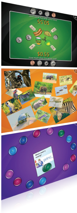
SMART Table applications – Addition Plus, Media, Multiple Choice

For teachers wanting to optimize both whole-class and small-group learning, the SMART Table is an excellent complement to the SMART Board™ interactive whiteboard. Teachers can introduce a concept to all students using the interactive whiteboard and then reinforce it through small-group activities on the SMART Table. It can also be used with the SMART Document Camera and SMART Sync™ classroom management software.